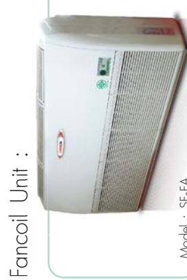
Fancoil Unit :