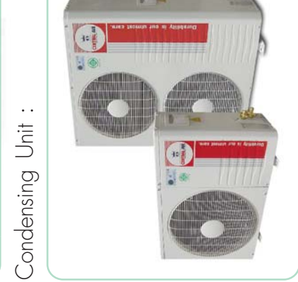
Condensing Unit :